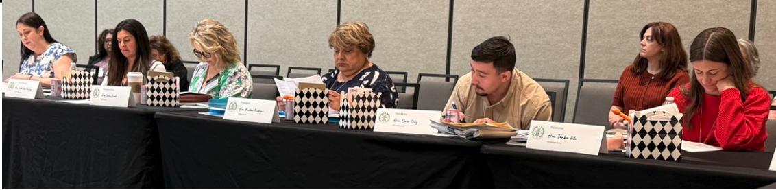
CTAT Board Meeting April 20, 2026.