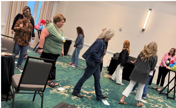
Fundraiser—Liquor pull/cake walk was a HUGE success. Thank you to everyone who participated.