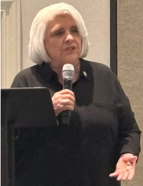
State Senator Judith Zaffirini (D-Laredo) was the highlight of our conference in April.